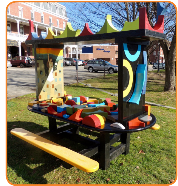
The Inaugural Table that started it all.